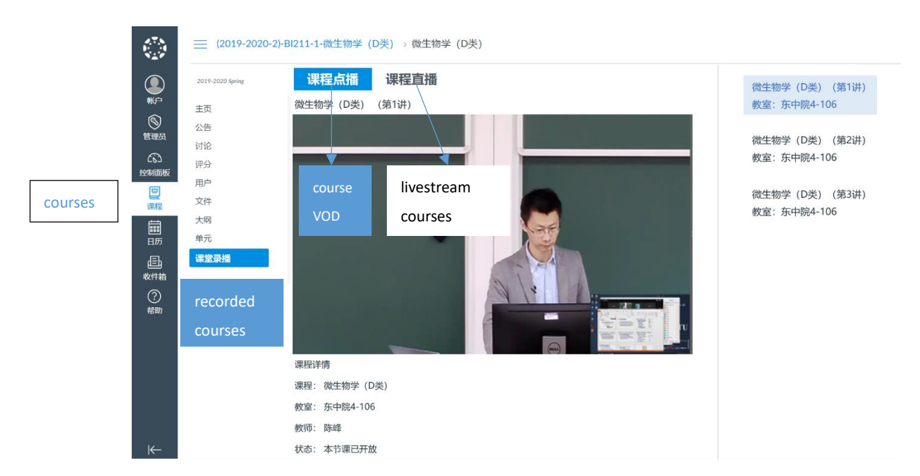
The Interface of Course VOD